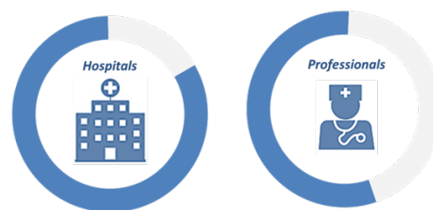
Figure 2: Hospitals and Professionals That Have Demonstrated Meaningful Use of Certified EHR Technology 2014