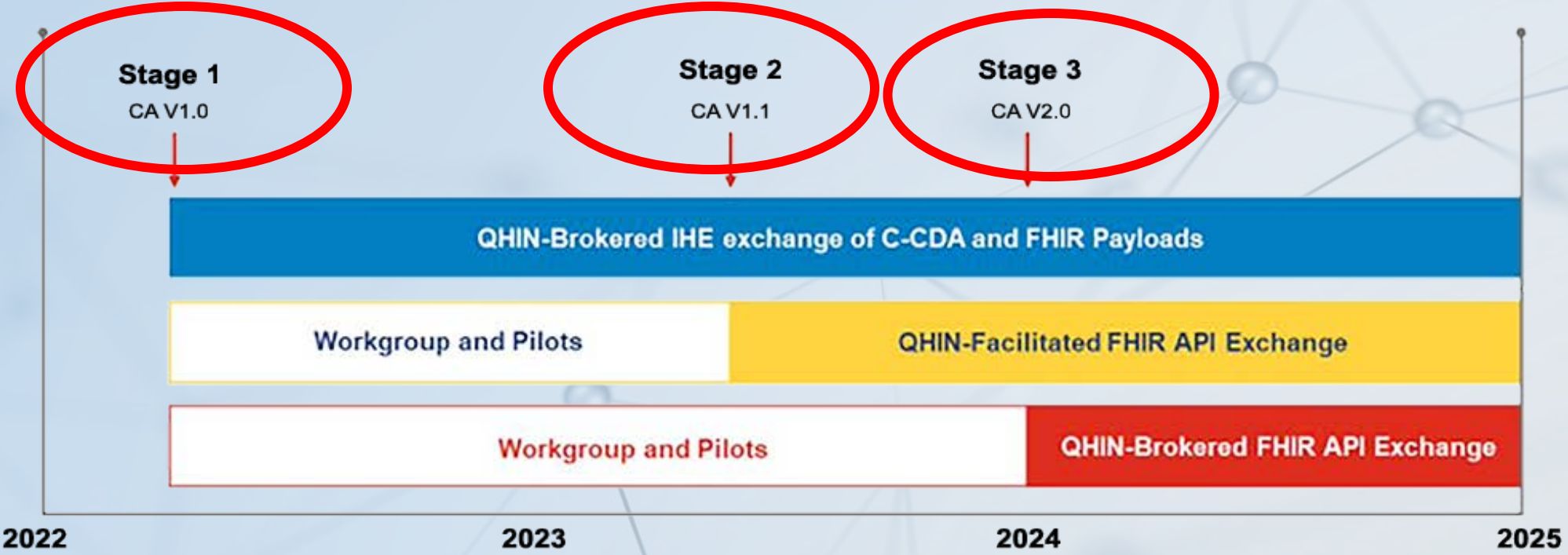
Diagram c/o The Sequoia Project